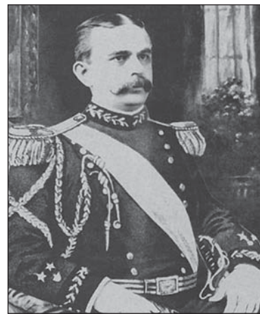
General Fred Crayton Ainsworth.

War and War of 1812 service records soon began. The Revolutionary War project required using Treasury, Interior, and State Department records, as well as records borrowed from some state governments to substitute for records lost in the disastrous War Department fire of 8 November 1800. When records of the Spanish-American War (1898) and Philippine Insurrection (1899–1902) arrived at Ainsworth's office, they were carded immediately. Beginning in 1903, Confederate service records were also carded from the War Department's collection of captured records plus records borrowed from Southern state governments. The ultimate result of all these projects was 58 million card records and related index cards!