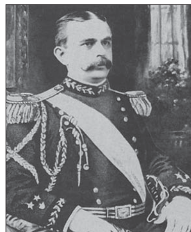
General Fred Crayton Ainsworth.